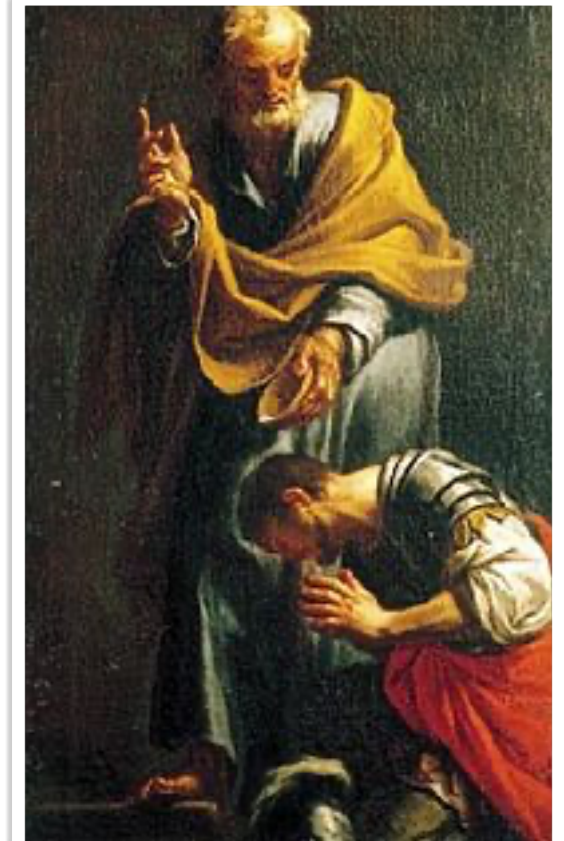
Peter Baptising the Centurion Cornelius by Francesco Trevisani, 1709 [Cohors II Italica Civium Romanorum]