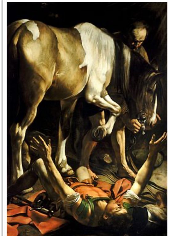
The Conversion of Paul Caravaggio, 1601 Santa Maria del Popolo, Rome

What liberty Caravaggio has taken with his composition that is unsupported by the text in Acts?