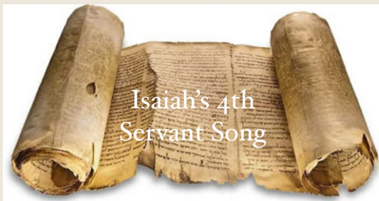
Isaiah's 4th Servant Song

The Great Isaiah Scroll presents 'A messenger coming across the mountains bringing good news... saying "Your God is king"' (Isaiah 52:7). This good news is made real through the Servant of the Lord ; a character who features in four Servant Songs.